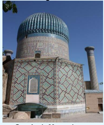
Gur Amir Mausoleum