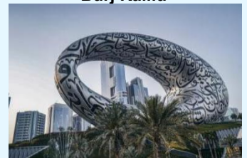
Museum of Future