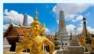
Grand Palace, Bangkok