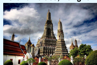
Temple of Dawn