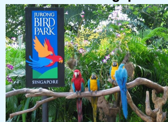
Singapore Bird Paradise