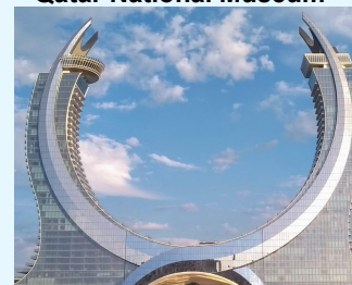
Raffles & Fairmont Hotels