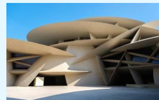
Qatar National Museum

Please Contact Us and tell us when and where you want to go, and we will get in touch with our offer and likely itinerary.