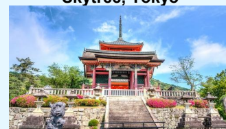
Senso-Ji Temple, Tokyo