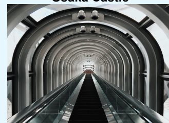
Umeda Sky Building, Osaka