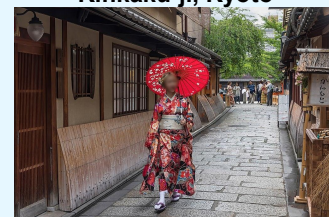
Gion Geisha District, Kyoto