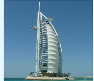
Burj Al Arab

Please Contact Us and tell us when and where you want to go, and we will get in touch with our offer and likely itinerary.