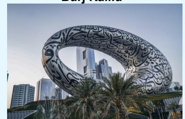
Museum of Future