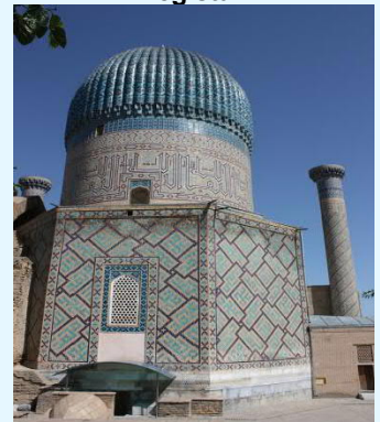
Gur Amir Mausoleum